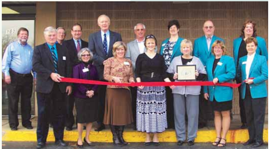
Chestnut Club Ribbon Cutting Ceremony (165 W. Chestnut Street, Burlington, WI)