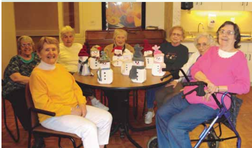
Bay Pointe Residents display their crafts

Earlier in the year, we experienced storms that caused power outages; however, with the generous donation of an emergency generator from the Auxiliary in 2009, residents and staff remained safe until the power was back on. The storms also brought minor flooding and with the help of United Mechanical, Inc the water was quickly removed without causing any damage. During the summer, residents enjoyed gardening and sharing their vegetables with their neighbors who didn't have gardens. Residents welcomed students from Meadowview School throughout the year during holiday gatherings.